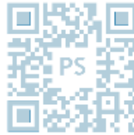
Scan for website