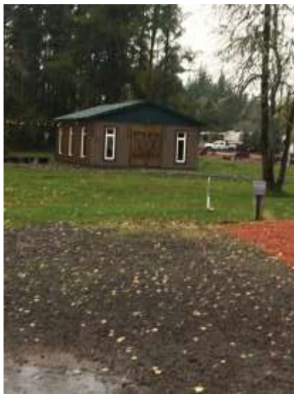
Clubhouse (between rainstorms)

The rain picked up again on Monday. As Ken and Laurie were leaving the lake was rising towards the road. Time to get home and put the RV away for few months.