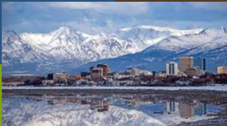
“Scene of the crime” - Hope, Alaska